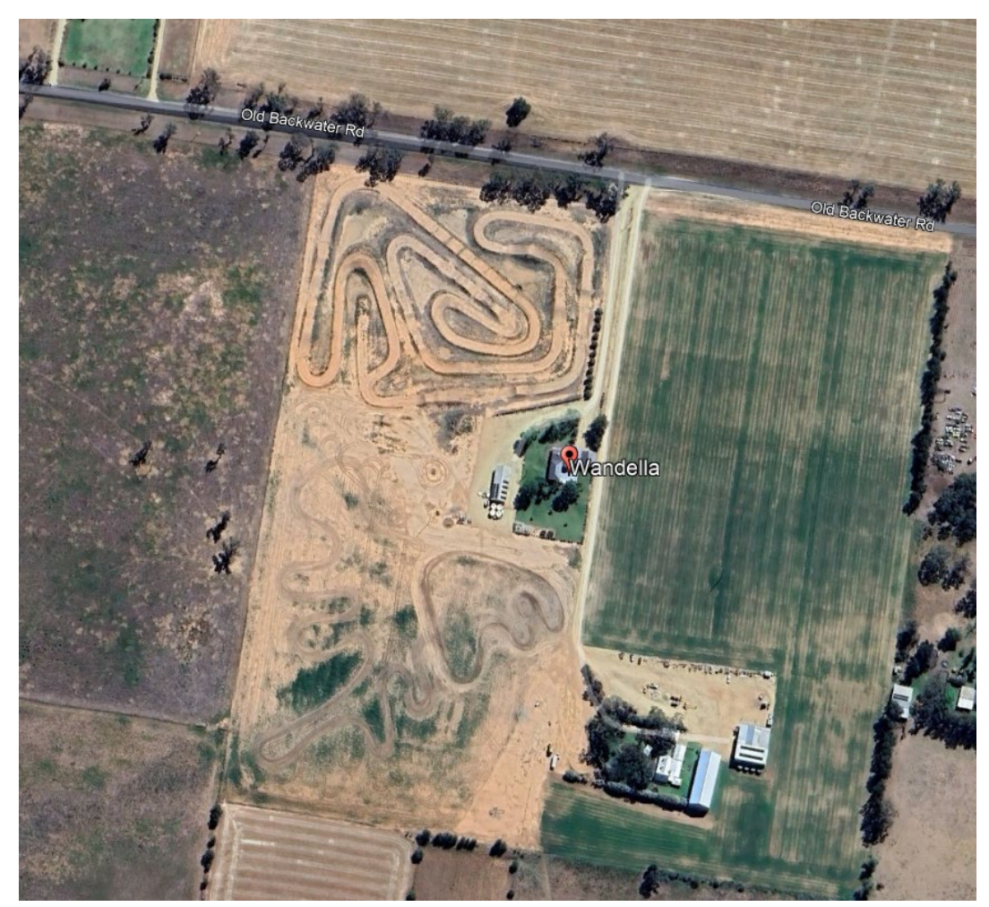
Figure 2: Aerial view of site (from Google Earth imagery dated 27 Sept 2023)

1. MODIFICATION TO DEVELOPMENT APPLICATION 2022/58.2 USE OF EARTHWORKS AS A MOTORBIKE TRACK AT 151 OLD BACKWATER ROAD, NARROMINE (Cont'd)